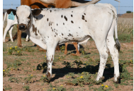
Spokesman X Point Rider bull