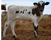
Spokesman X Point Rider bull